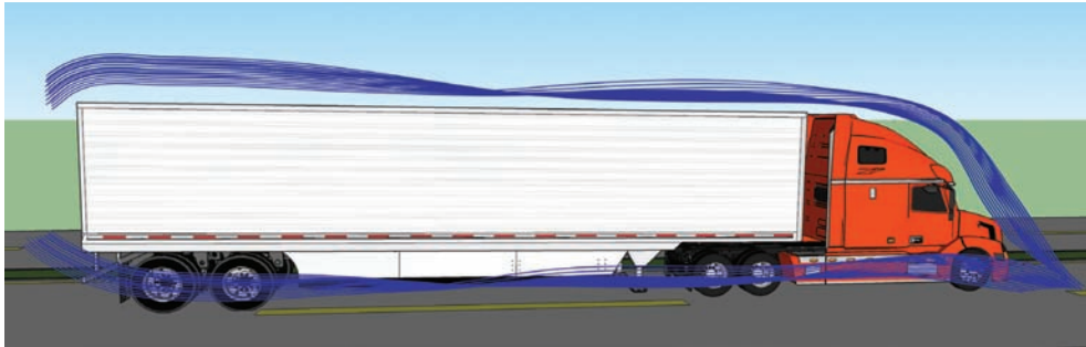
TrailerBlade Flaps allow air and water to pass through, reducing spray and aerodynamic drag.