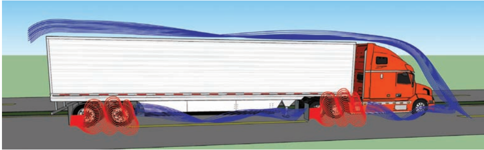
Traditional solid flaps disrupt the air flow and generate spray during wet conditions.